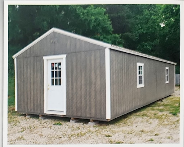
Cottage Lakeside shown in Driftwood stain.