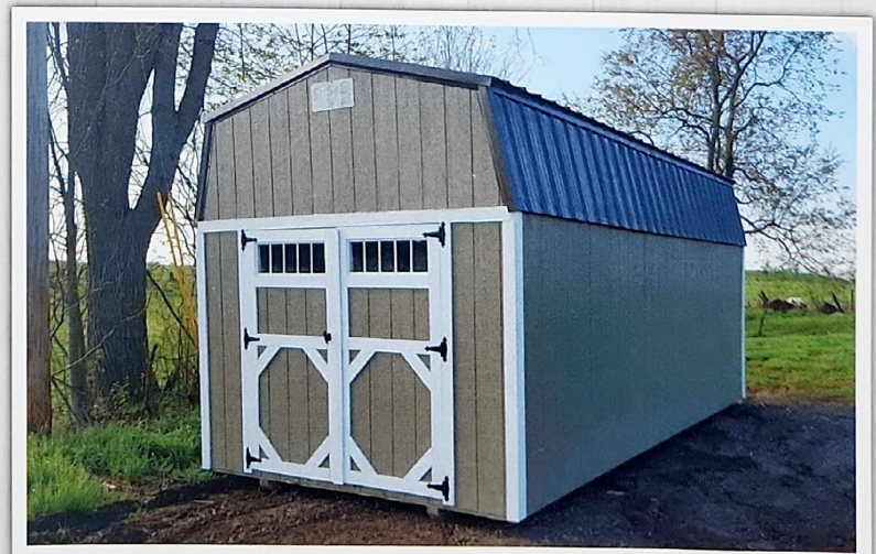
SHOWN: Lofted High Barn, Taupe with white trim, a standard feature, with two optional windows.