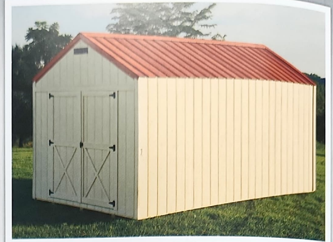
SHOWN: Standard Cottage in LP Smart Siding, factory-primed.