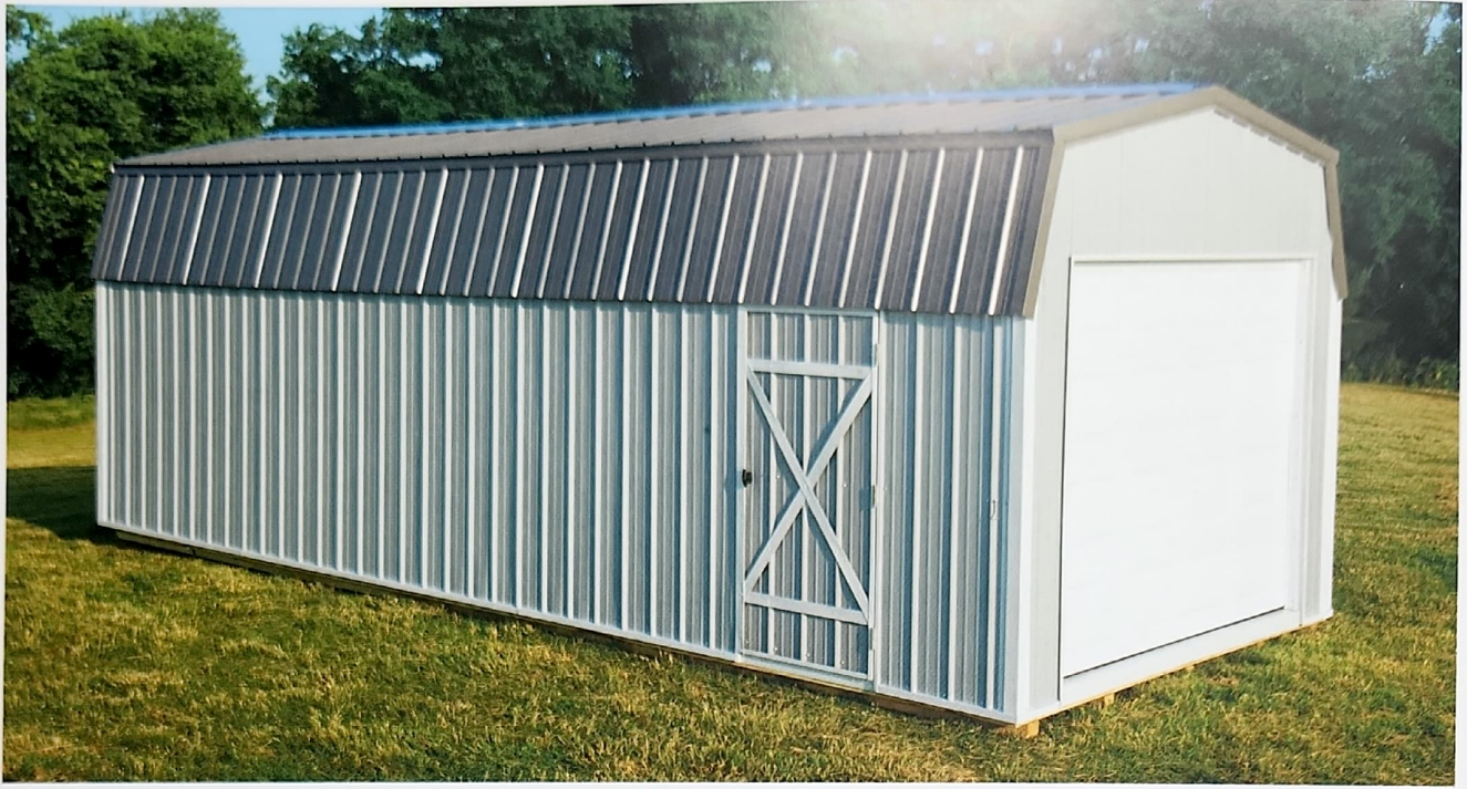
Our High Barn Style Garage shown in Metal Siding.