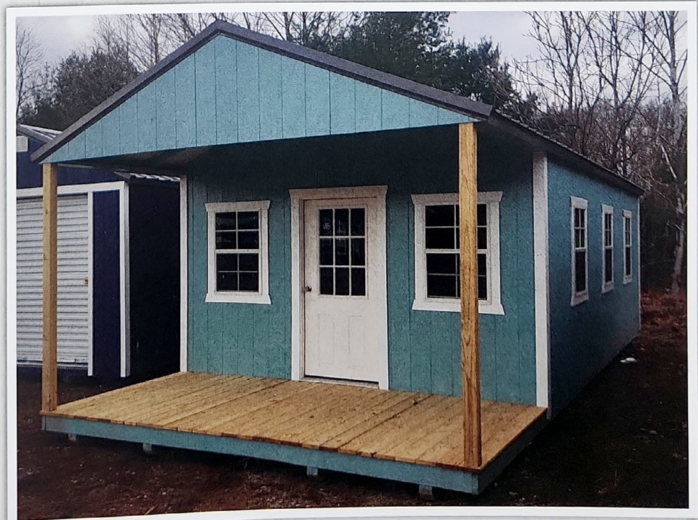
Lakeside cabin with LP Smart siding Metal roof with optional windows.