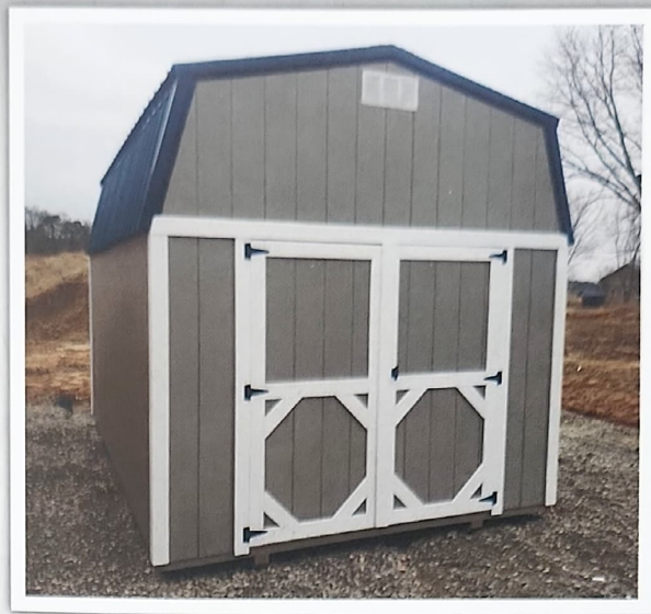
SHOWN: Standard Lofted High Barn.