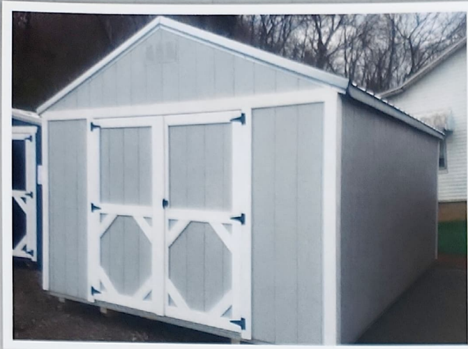
SHOWN: Deluxe Cottage with LP Smart Siding Light Gray.