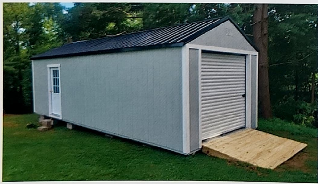
Lakeside Cottage Garage LP Smart Siding Light Gray with Black Metal Roof.