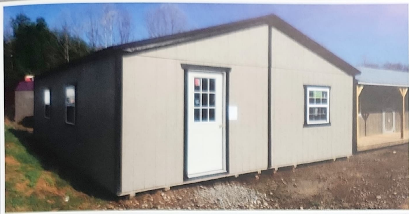
Double wides need to have a level pad to set on or a solid base. Talk with salesperson.