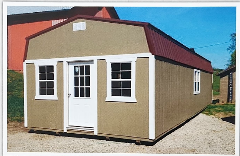
SHOWN: Lofted High Barn with optional doors and windows.