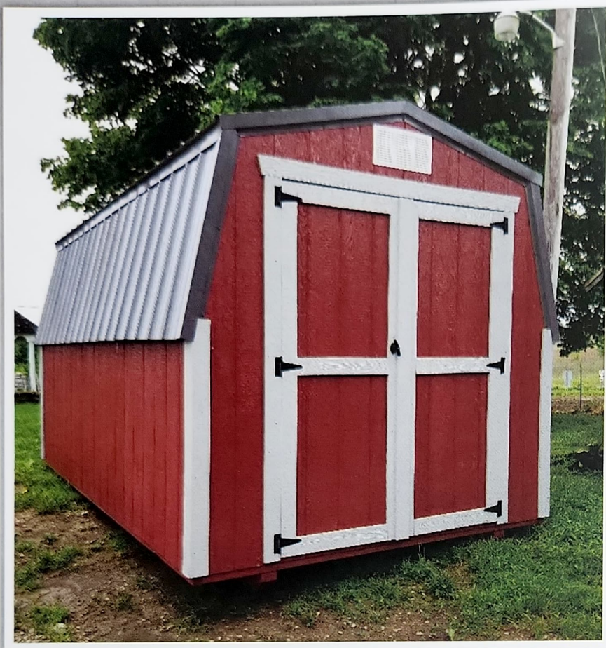
Mini Barn sample photo shows the structure in T1-11 with our standard red paint and grey trim with a grey metal roof.